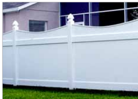
Concave with optional gothic post caps