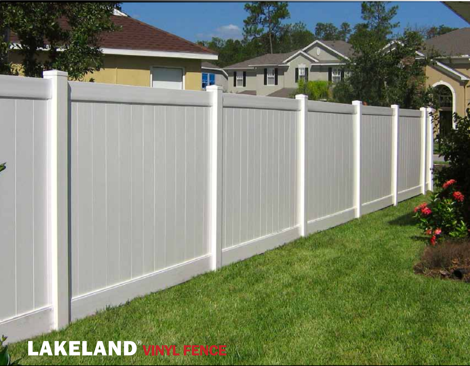
LAKELAND ® VINYL FENCE