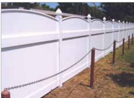
Convex with optional gothic post caps