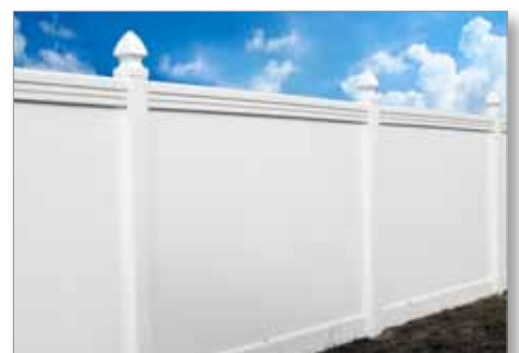
The Maxwell with optional gothic post caps